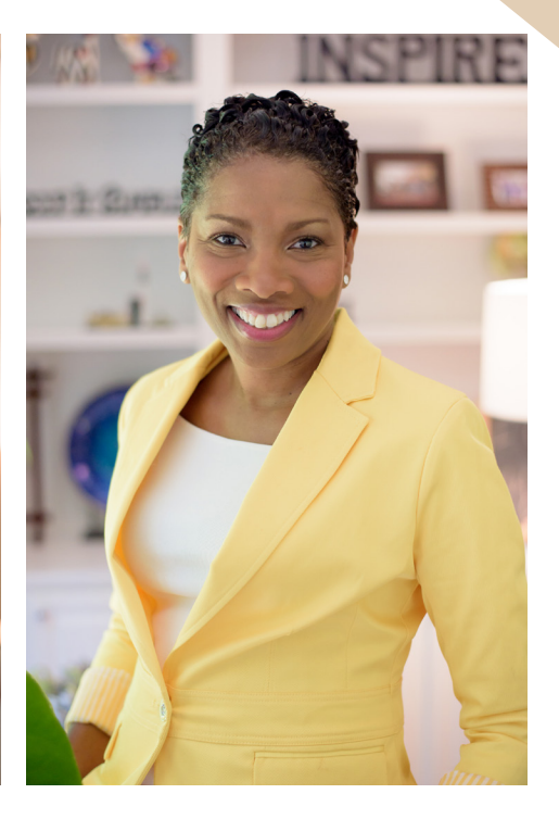
CLICK TO DOWNLOAD HI-RES IMAGE CLICK TO DOWNLOAD HI-RES IMAGE CLICK TO DOWNLOAD HI-RES IMAGE